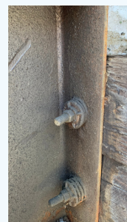
Steep Creek Bridge - 18 yrs after application of S2S