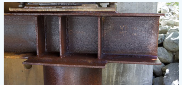
Treated with S2S